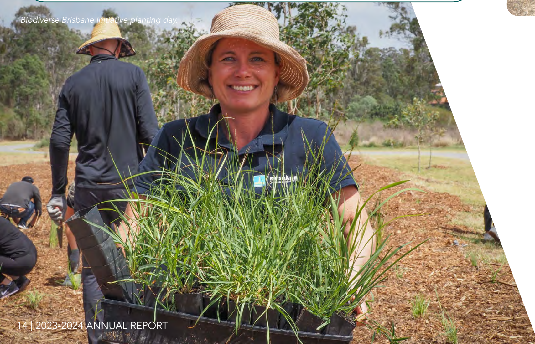
Biodiverse Brisbane Initiative planting day.