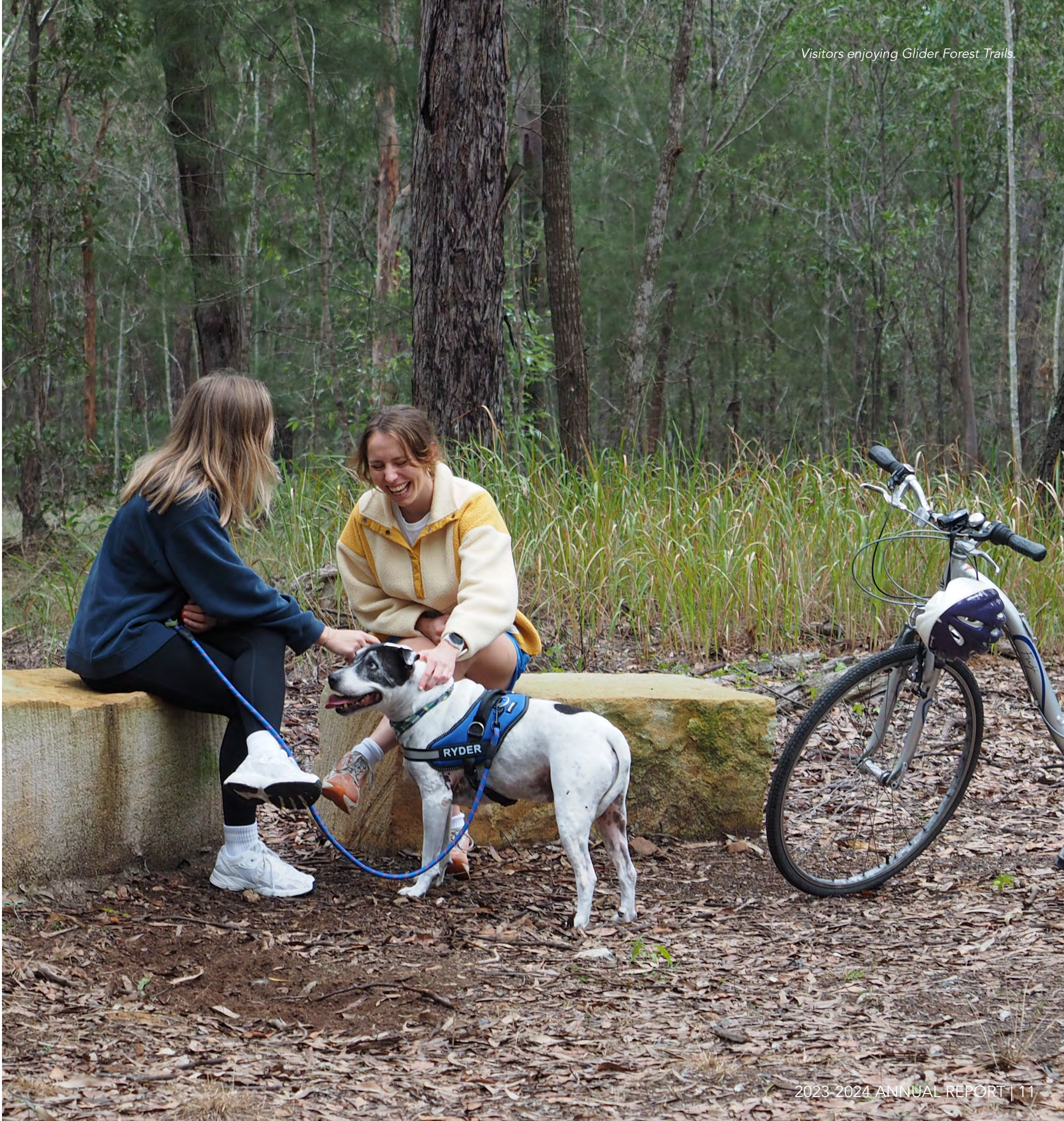
Visitors enjoying Glider Forest Trails.