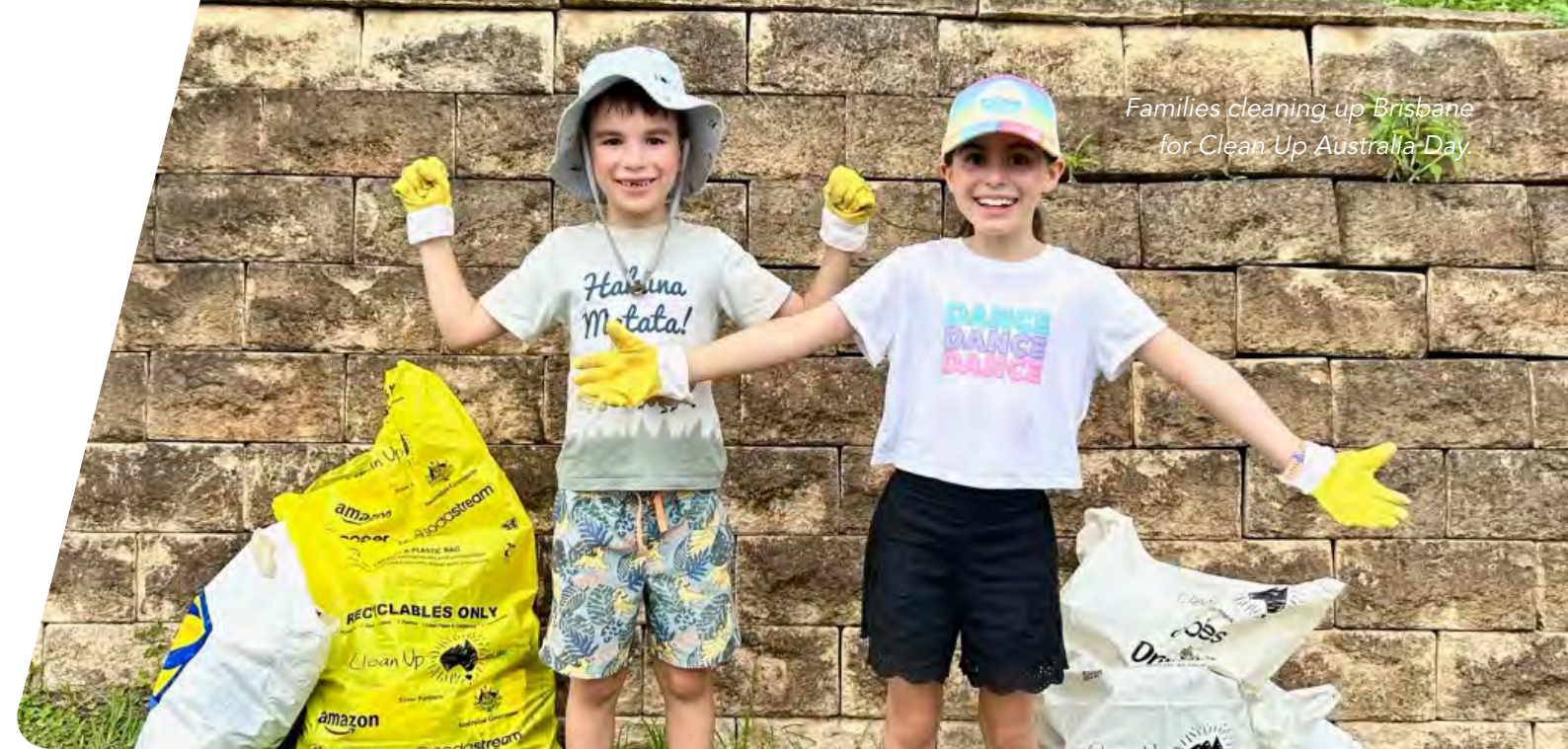
Families cleaning up Brisbane for Clean Up Australia Day.