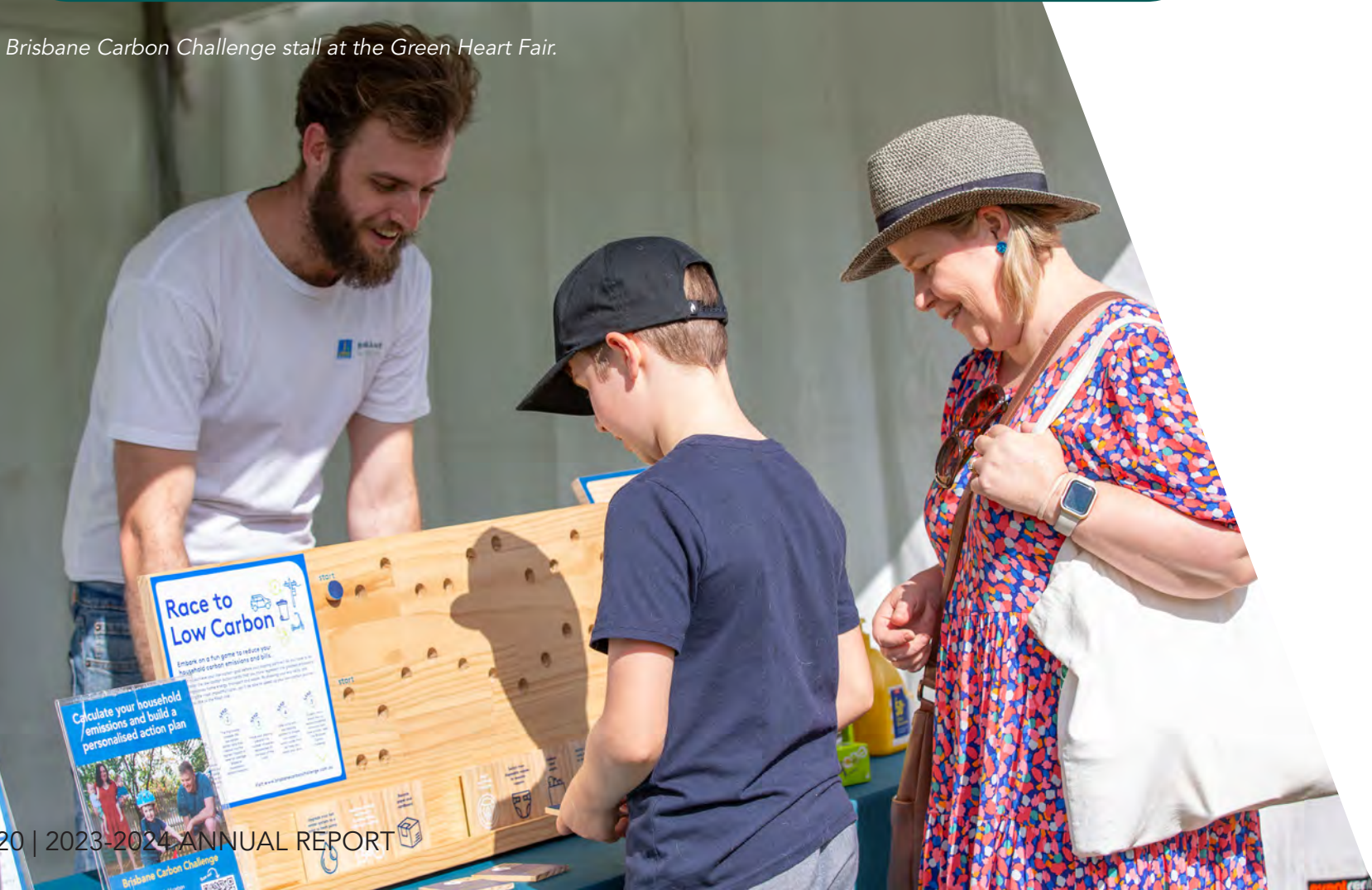
Brisbane Carbon Challenge stall at the Green Heart Fair.