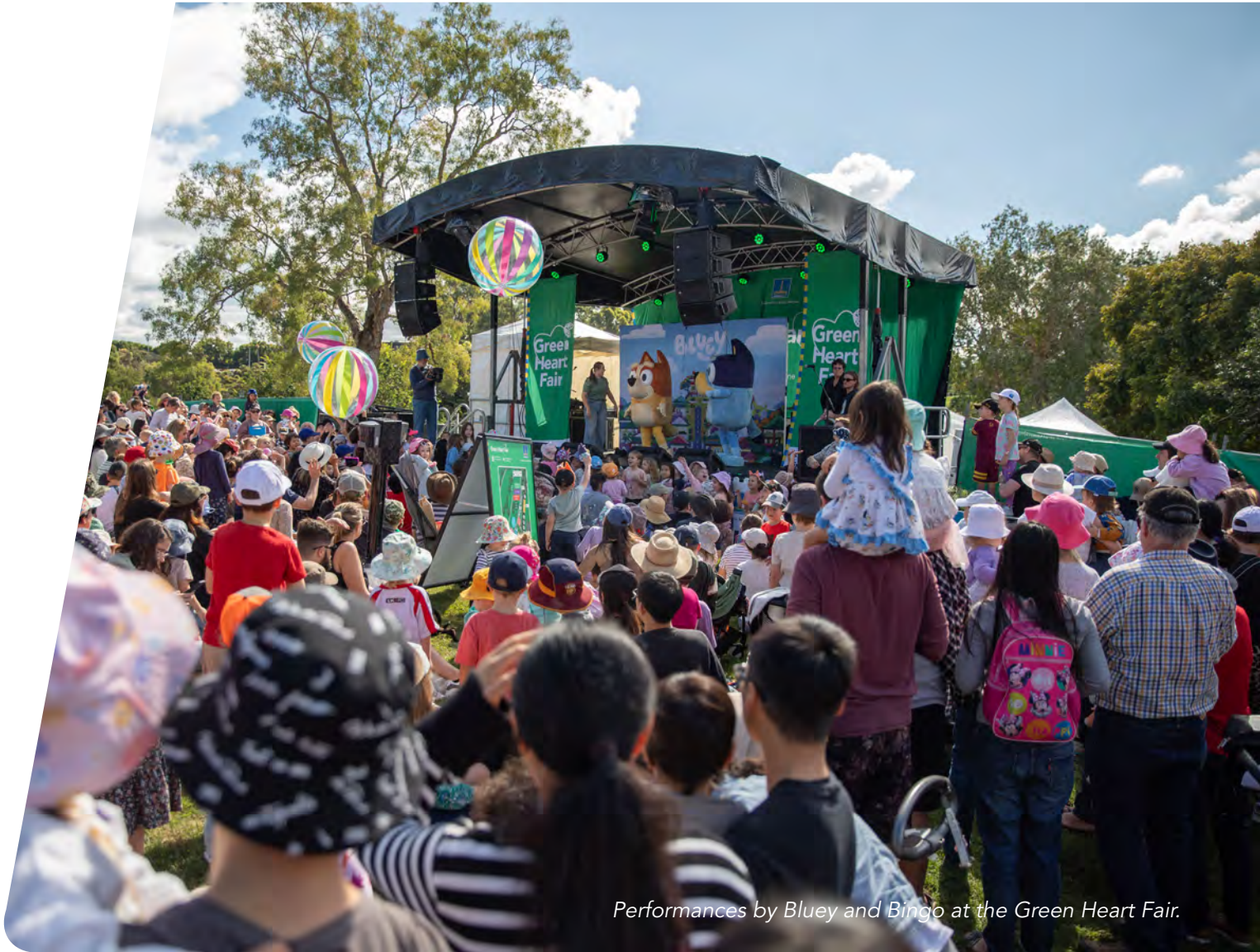
Performances by Bluey and Bingo at the Green Heart Fair.