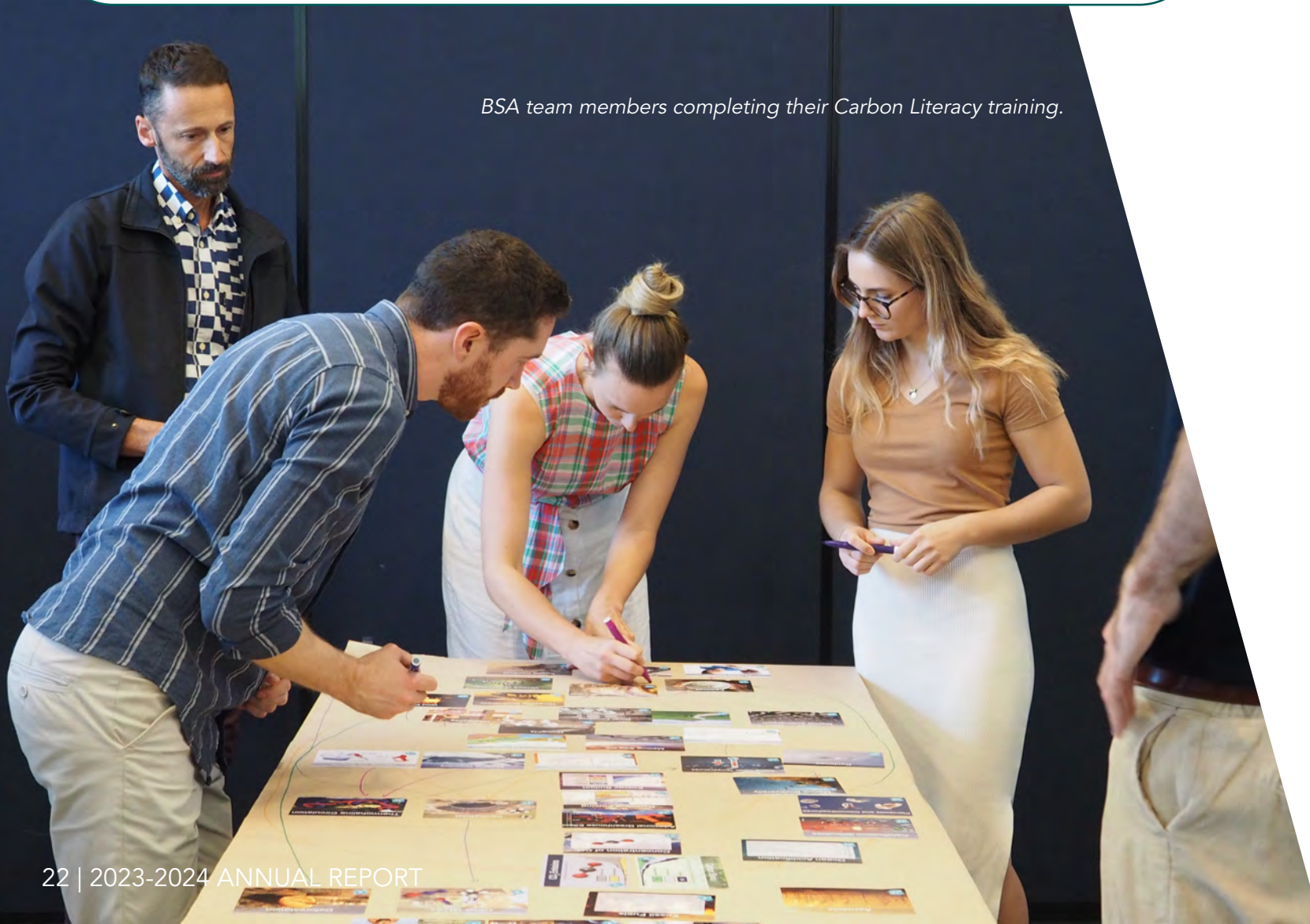
BSA team members completing their Carbon Literacy training.