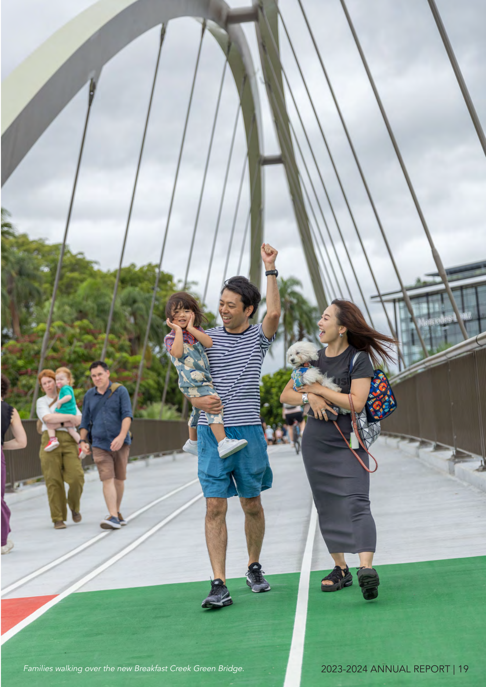
Families walking over the new Breakfast Creek Green Bridge.