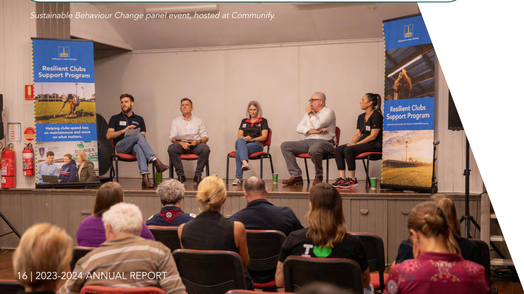
Sustainable Behaviour Change panel event, hosted at CommuniFY.