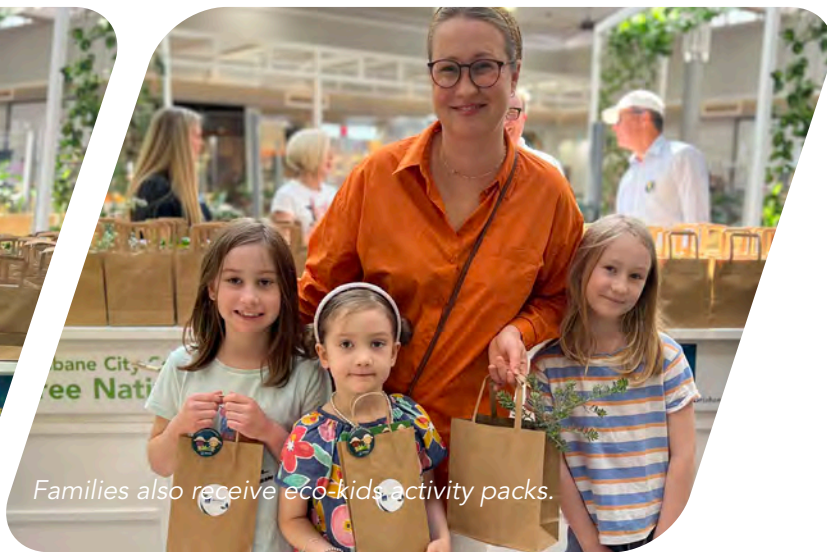
Families also receive eco-kids activity packs.