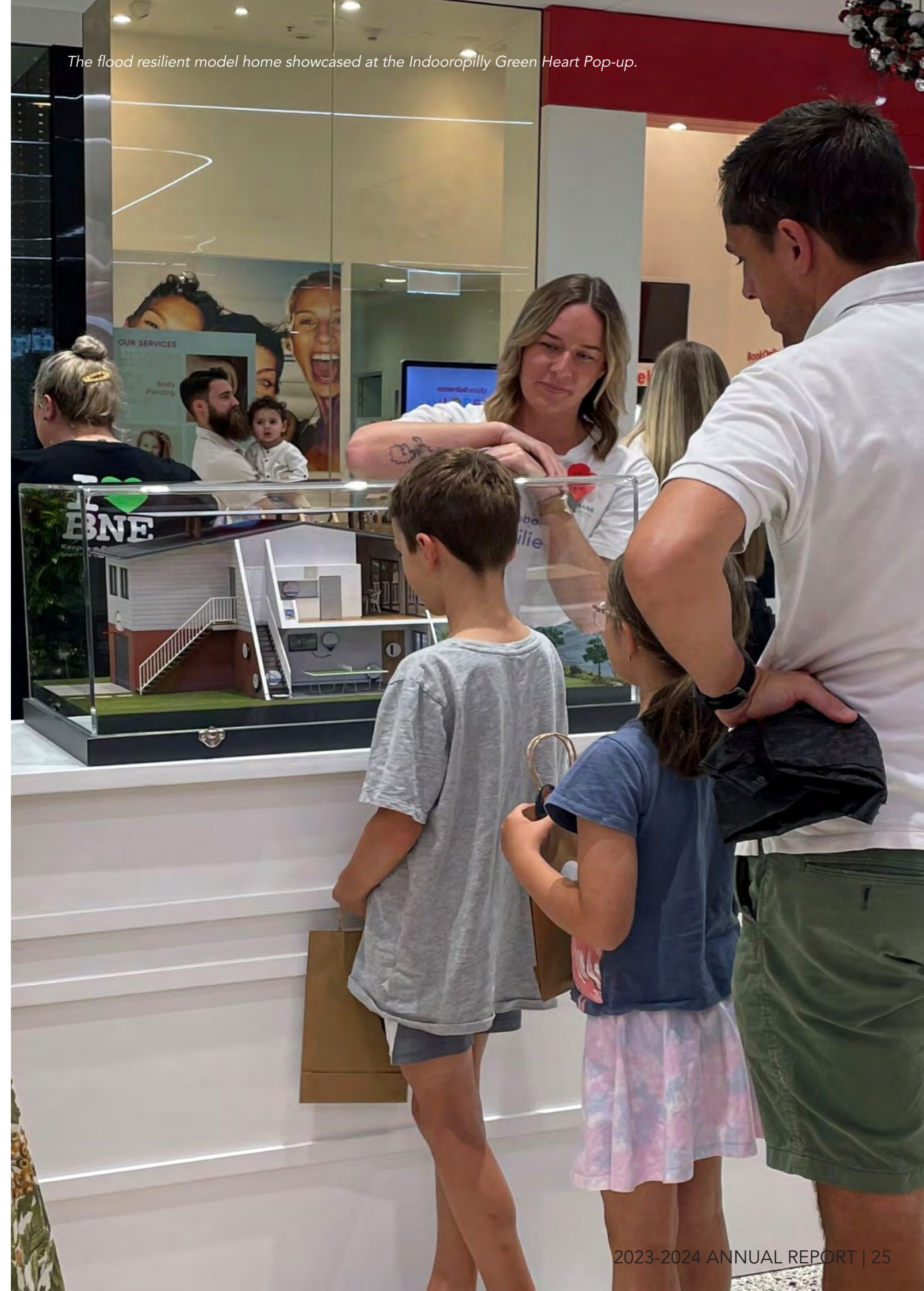
The flood resilient model home showcased at the Indooroopilly Green Heart Pop-up.