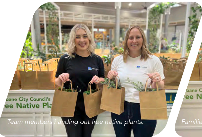
Team members handing out free native plants.