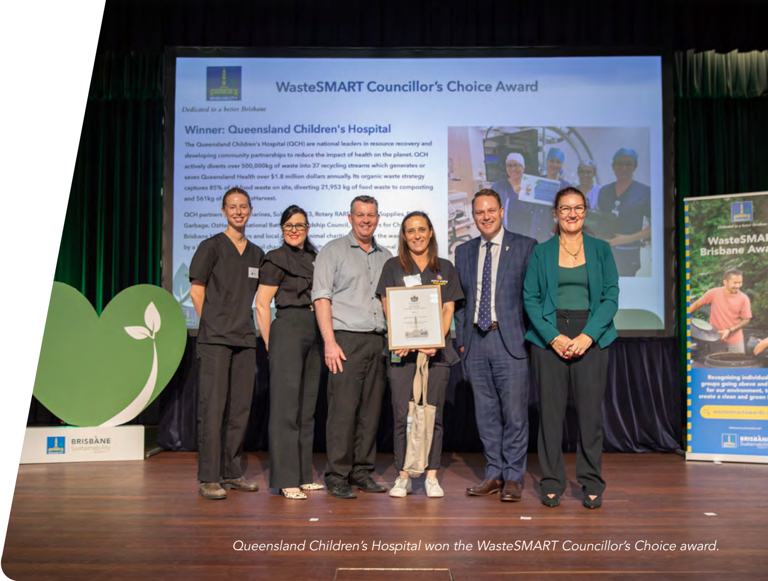
Queensland Children's Hospital won the WasteSMART Councillor's Choice award.