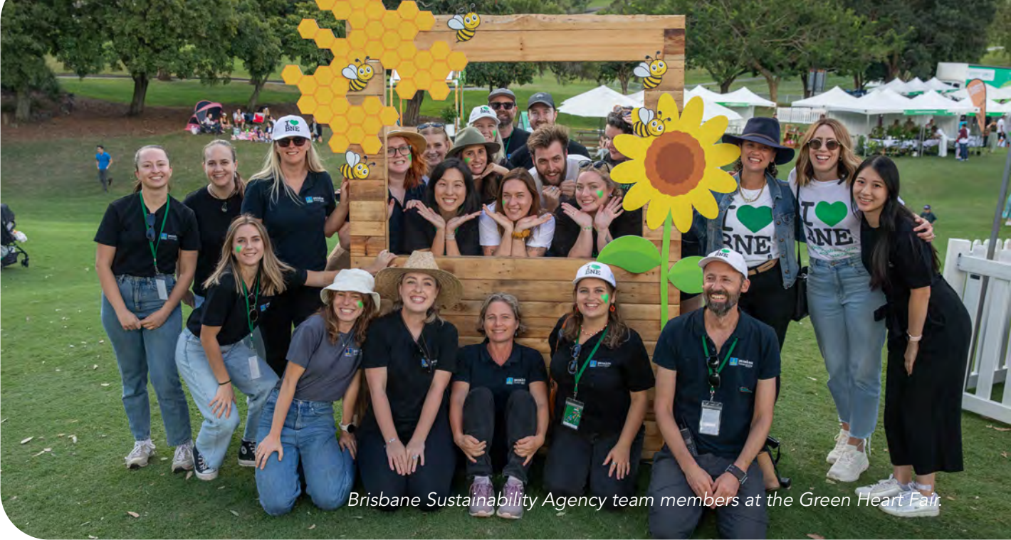
Brisbane Sustainability Agency team members at the Green Heart Fair.

We are committed to contributing to a climate resilient community who can prepare for, live through and recover quickly from extreme weather events with minimal disruption.